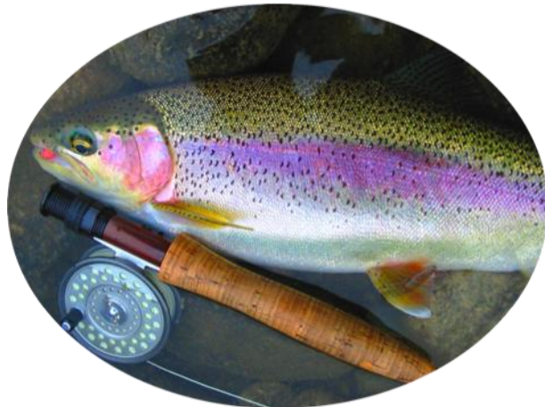
Gorgeous Rainbow Trout