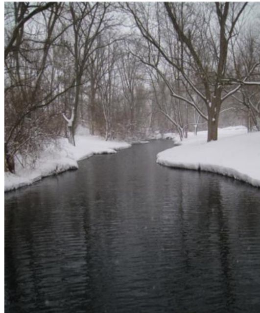
Year Round Fishing

Unlimited season – 24/7/365 – stocked, staffed, and ready-to-go – we catch fish in February here.