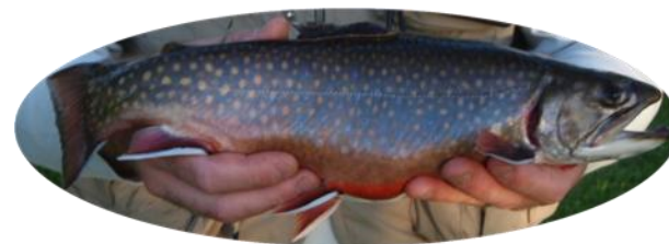
Magnificent Brook Trout