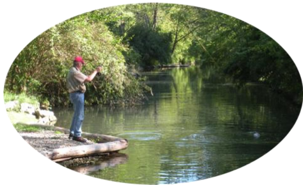
Fish in a natural setting