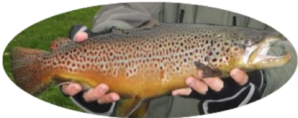
Beautiful Brown Trout