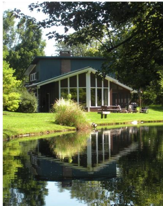
The Jack Klages Club House

Or, leave a message at the club office at: 937-599-5784